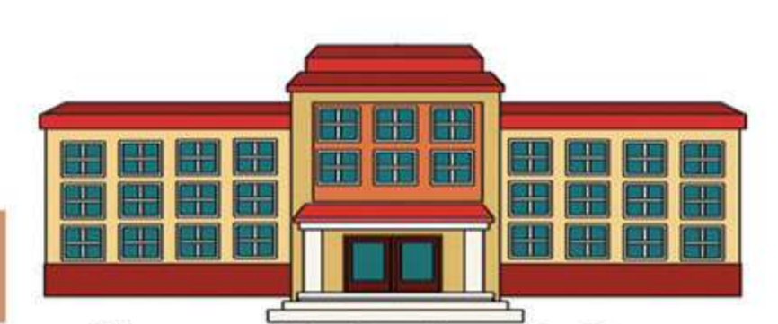
Karsgutti Junior College